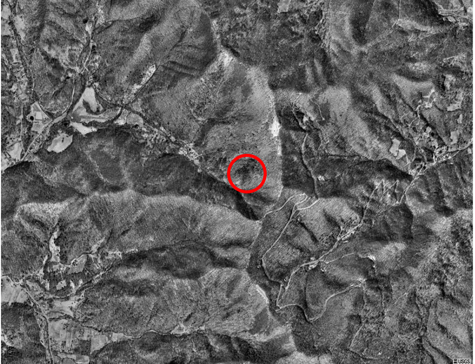
USGS Orthophotoquad: Carvers Gap 7.5' Quadrangle 4-6-98